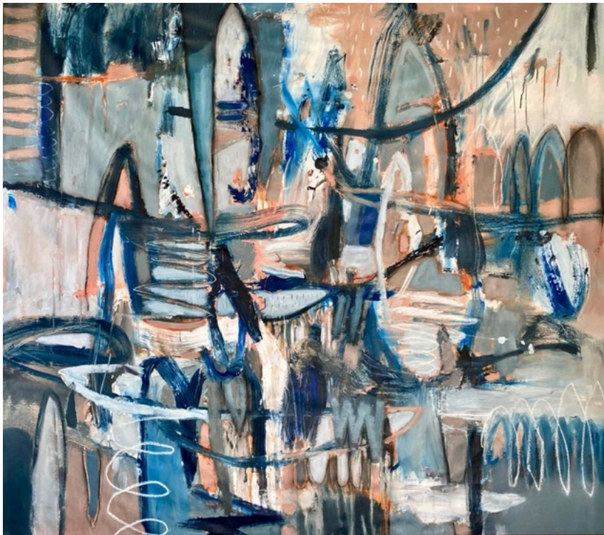
Subjective Interpretations III., 2025 Acrylic on canvas 60 x 68 in