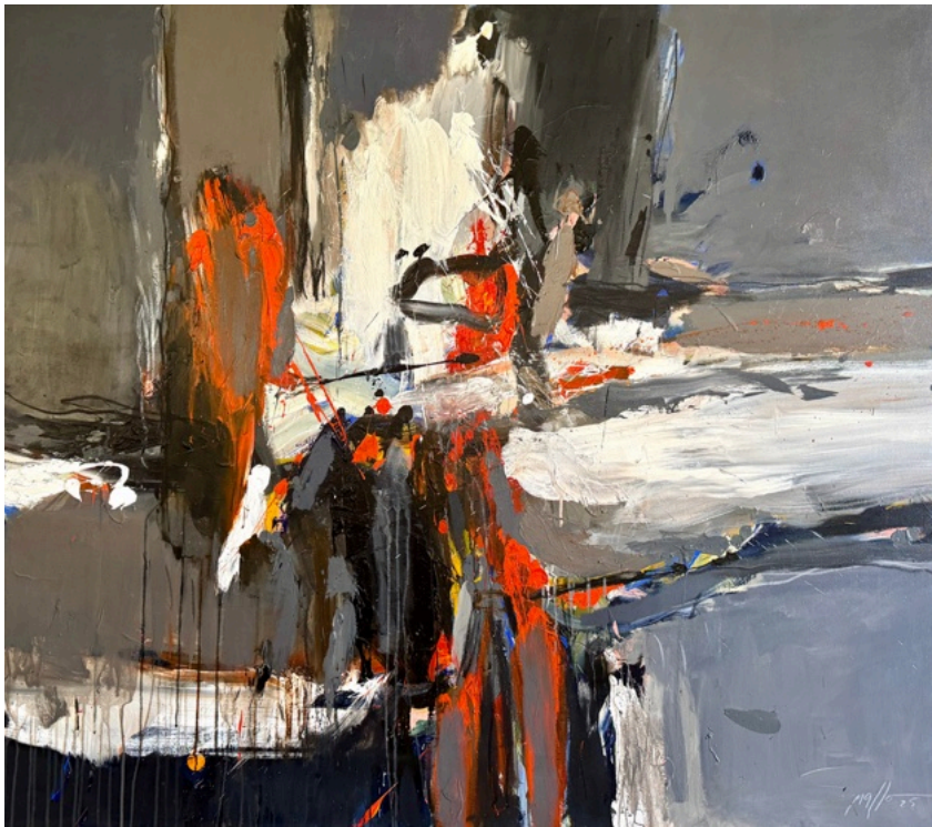
Lilies & Sunflowers, 2025 Acrylic on canvas 51 x 60 in