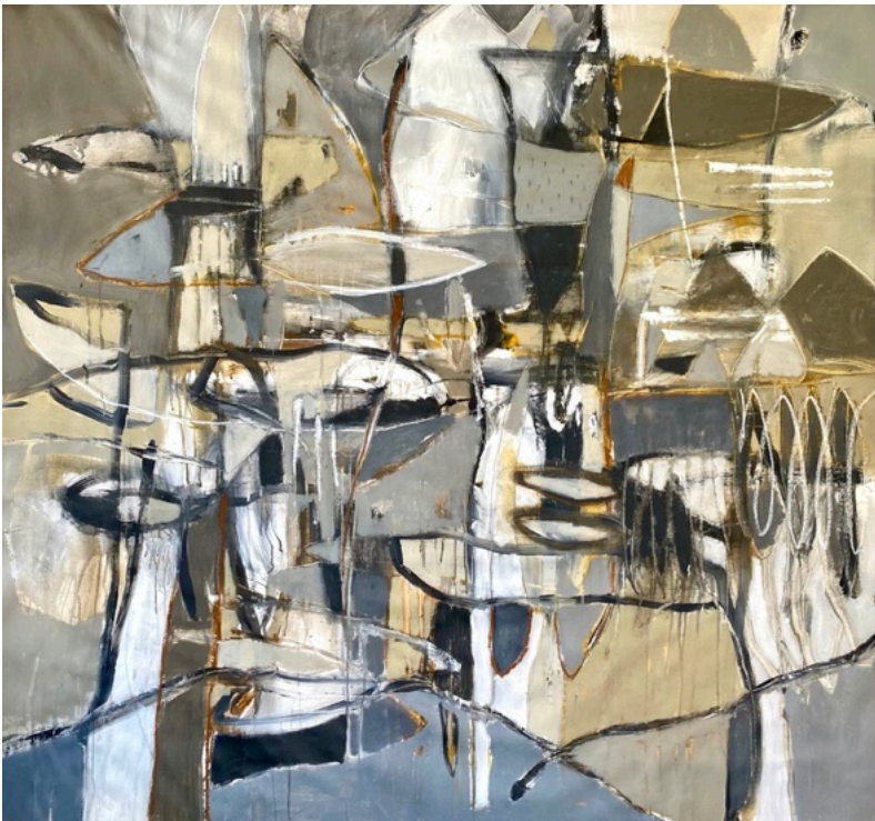
Subjective Interpretations I., 2025