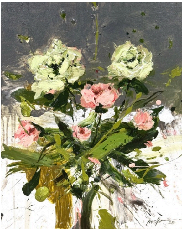
ROSE BOUQUET, 2025 OIL ON CANVAS 20 X 16 IN