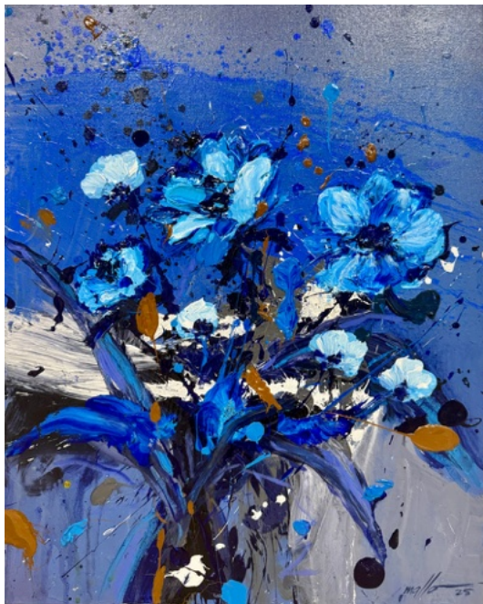
MANCHAS DE JARDIN, 2025 ACRYLIC ON CANVAS 20 X 16 IN