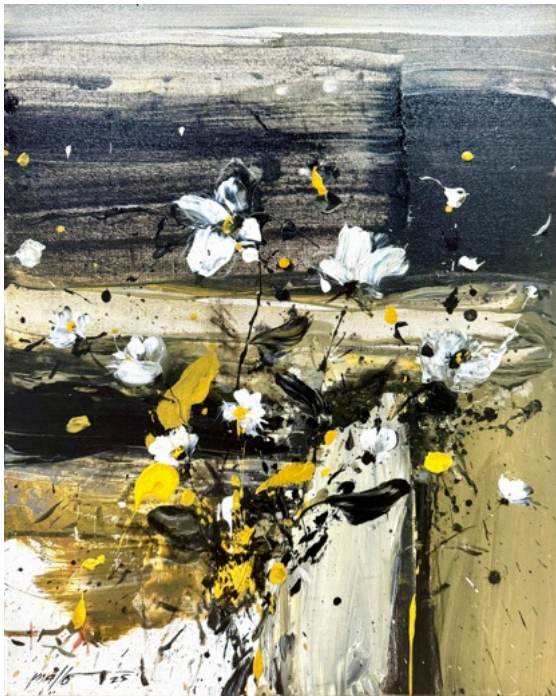
MANCHAS DE JARDIN, 2025 ACRYLIC ON CANVAS 20 X 16 IN