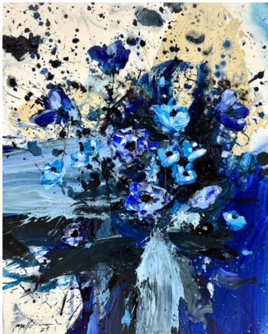
MANCHAS DE JARDIN, 2025 ACRYLIC ON CANVAS 20 X 16 IN / 26.5 X 22 IN (FRAMED)