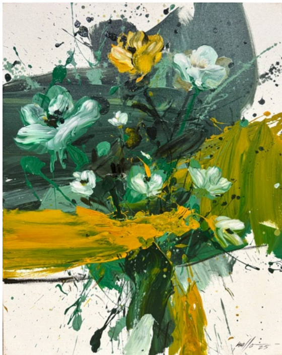
MANCHAS DE JARDIN, 2025 ACRYLIC ON CANVAS 20 X 16 IN