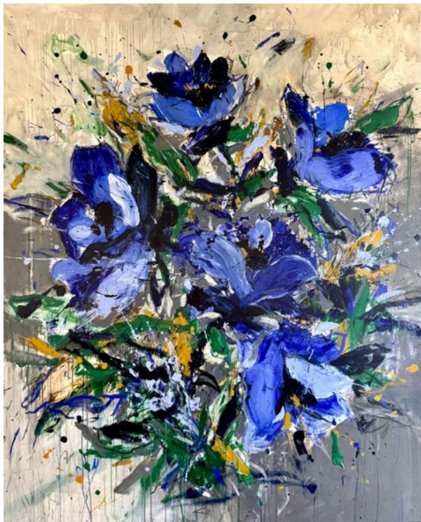
SPRING GARDEN SERIES, 2025 ACRYLIC ON CANVAS 75 X 61 IN