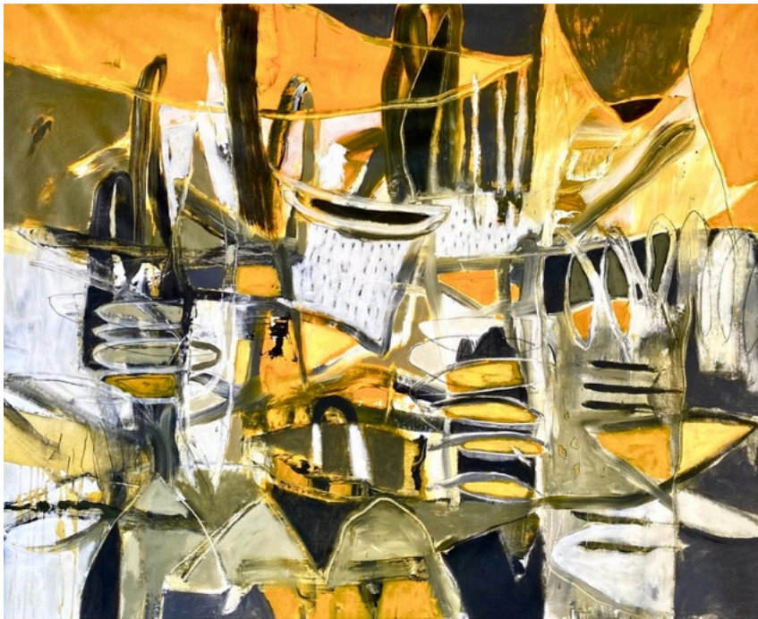
Subjective Interpretations II., 2025 Acrylic on canvas 48 x 60 in