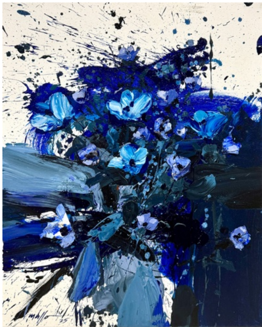
MANCHAS DE JARDIN, 2025 ACRYLIC ON CANVAS 20 X 16 IN / 26.5 X 22 IN (FRAMED)