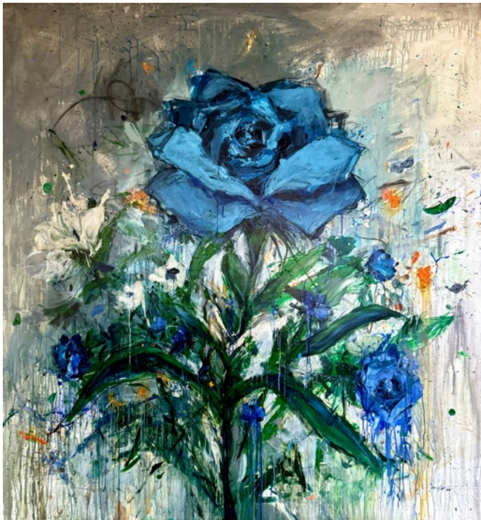
BLUE ROSE - SPRING GARDEN SERIES, 2025 ACRYLIC ON CANVAS 75 X 70.5 IN