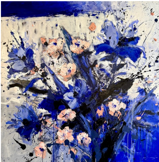
MANCHAS DE JARDIN, 2025 ACRYLIC ON CANVAS 39.5 X 39.5 IN