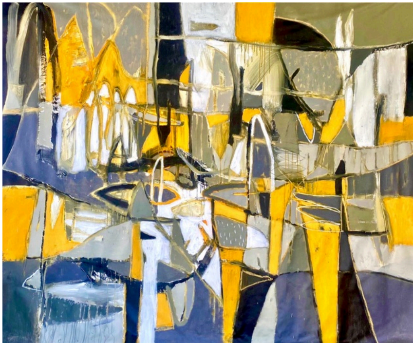
Subjective Interpretations IV., 2025 Acrylic on canvas 60 x 68 in