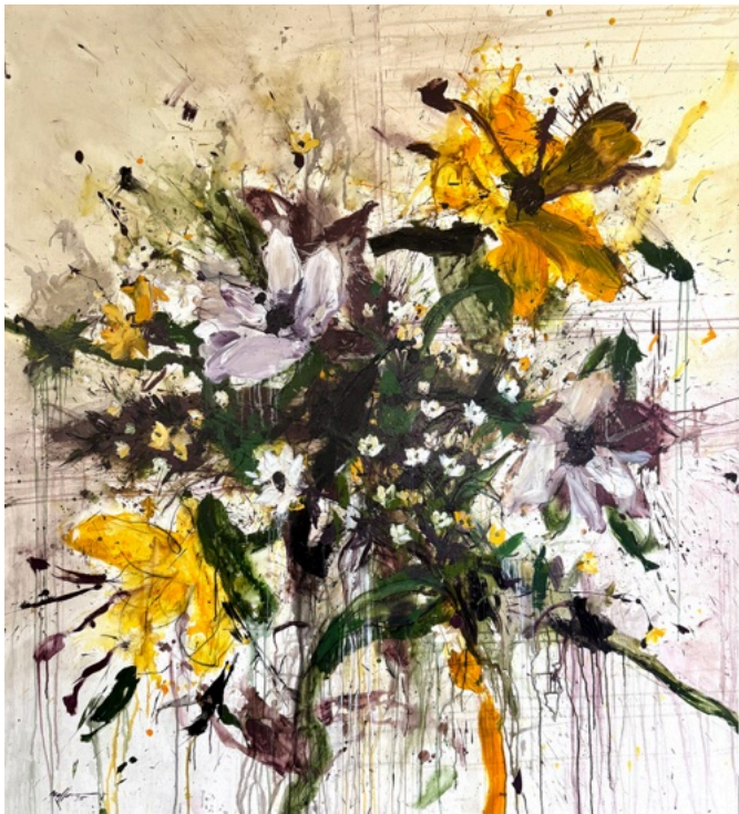
GARDEN BOUQUET - SPRING GARDEN SERIES, 2025 ACRYLIC ON CANVAS 72 X 66 IN