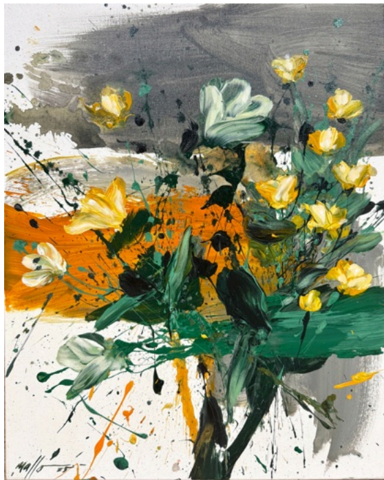
MANCHAS DE JARDIN, 2025 ACRYLIC ON CANVAS 20 X 16 IN