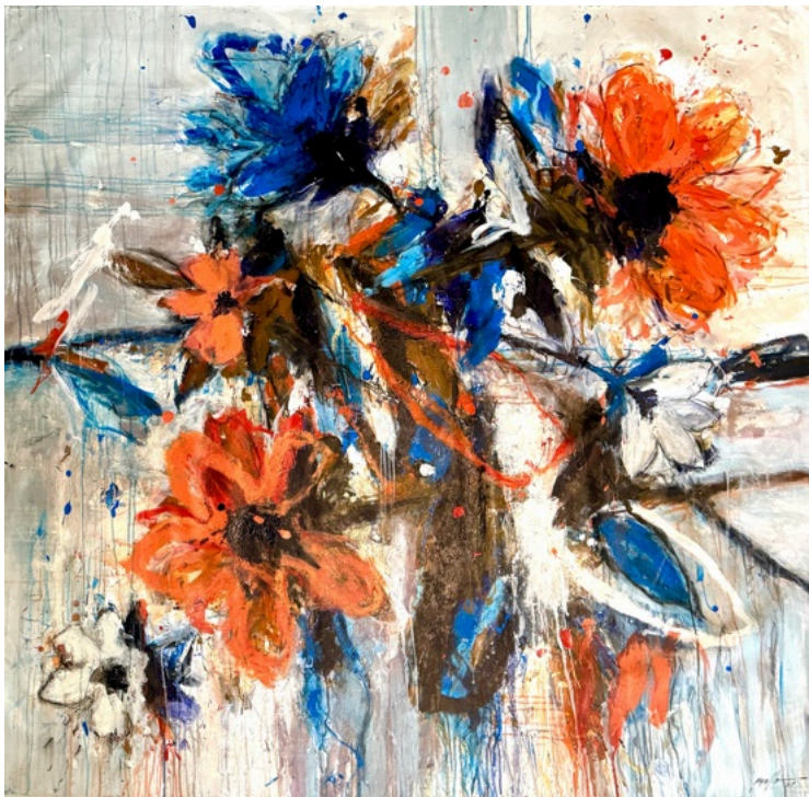
CORNFLOWERS - SPRING GARDEN SERIES, 2025 ACRYLIC ON CANVAS 67 X 67 IN